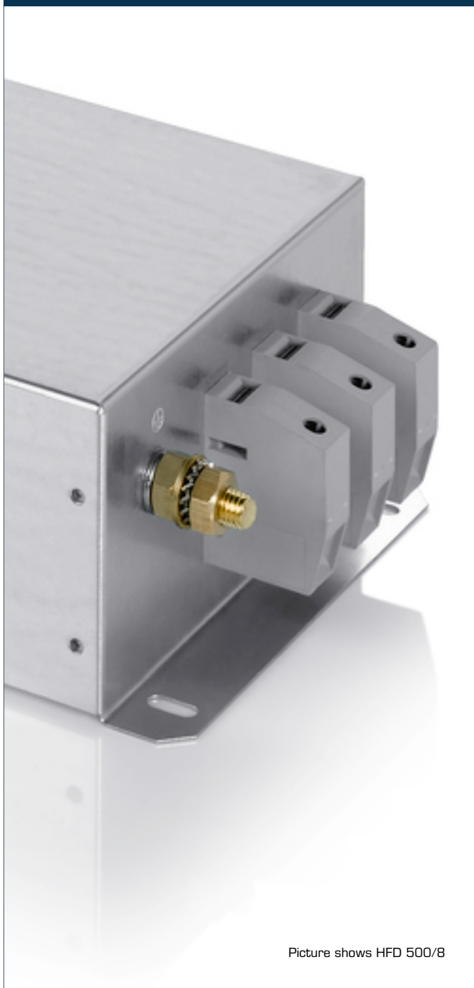
Picture shows HFD 500/8