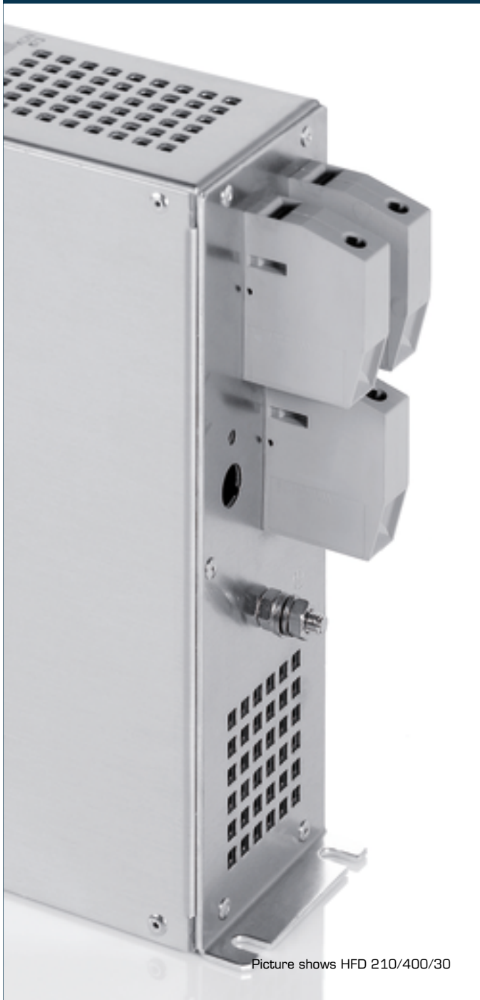
Picture shows HFD 210/400/30