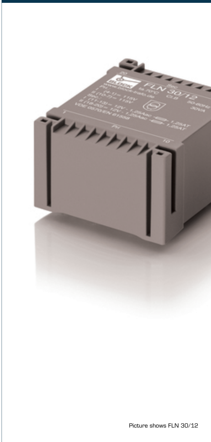
Picture shows FLN 30/12