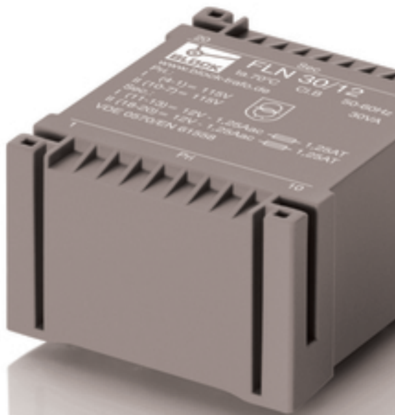
Picture shows FLN 30/12