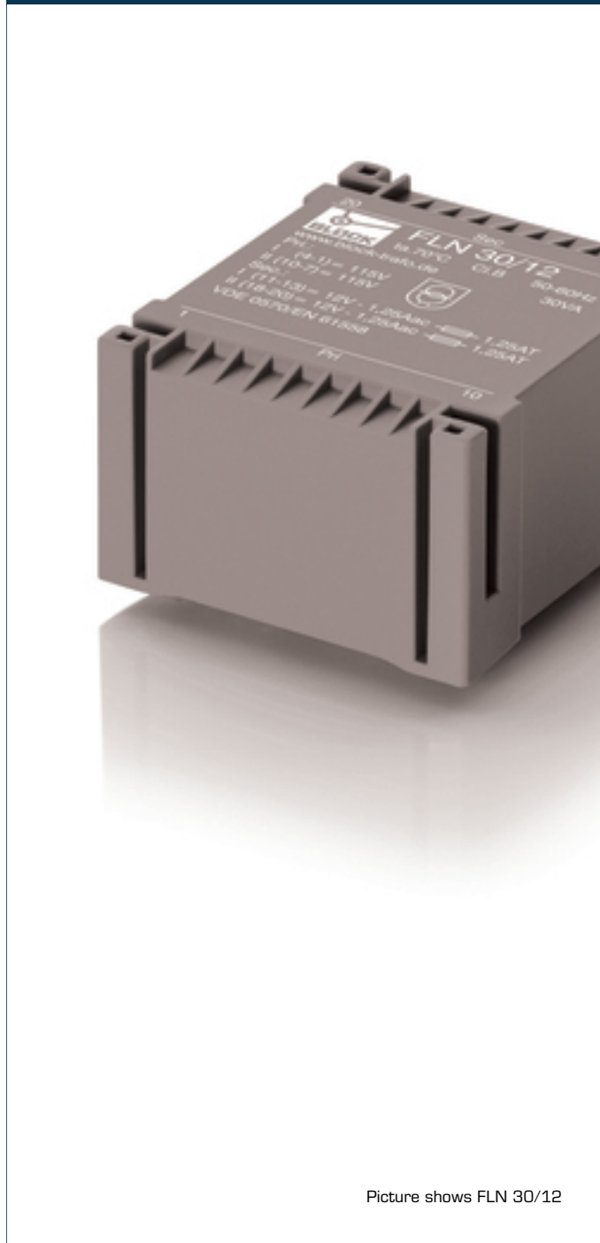
Picture shows FLN 30/12