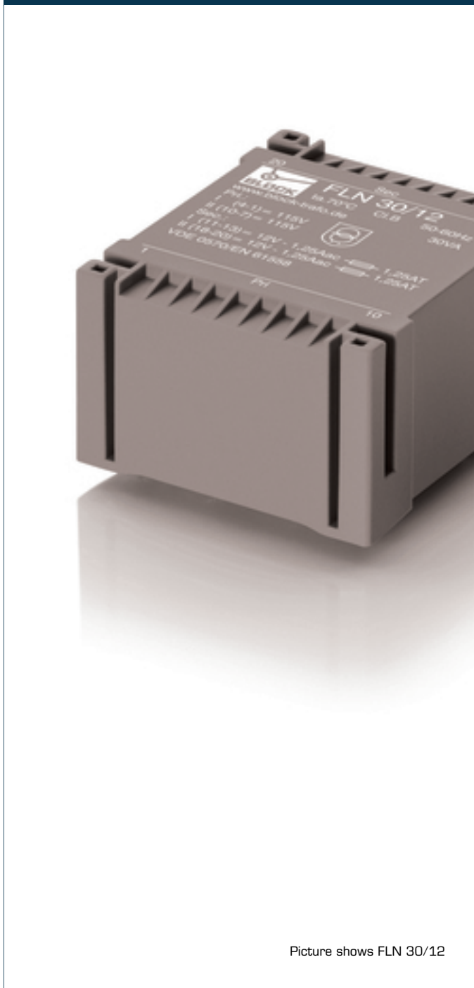
Picture shows FLN 30/12