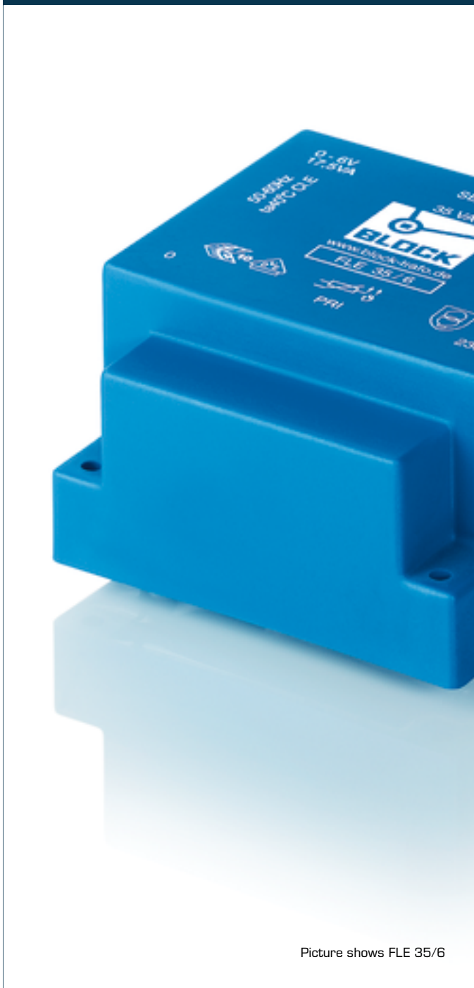
Picture shows FLE 35/6