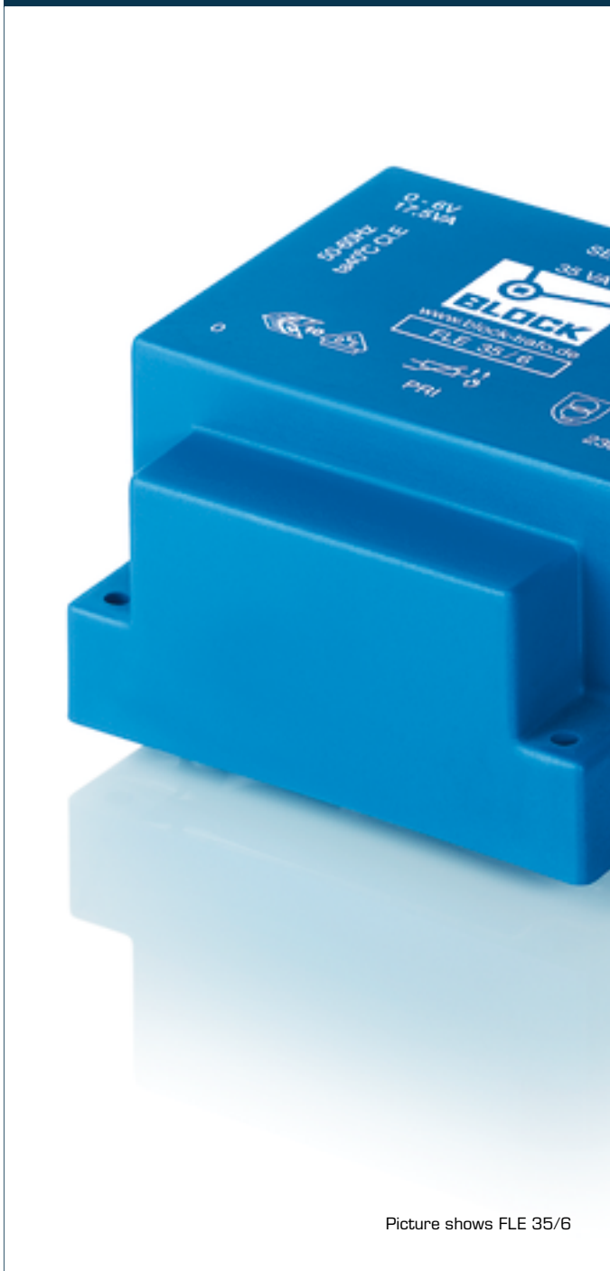
Picture shows FLE 35/6