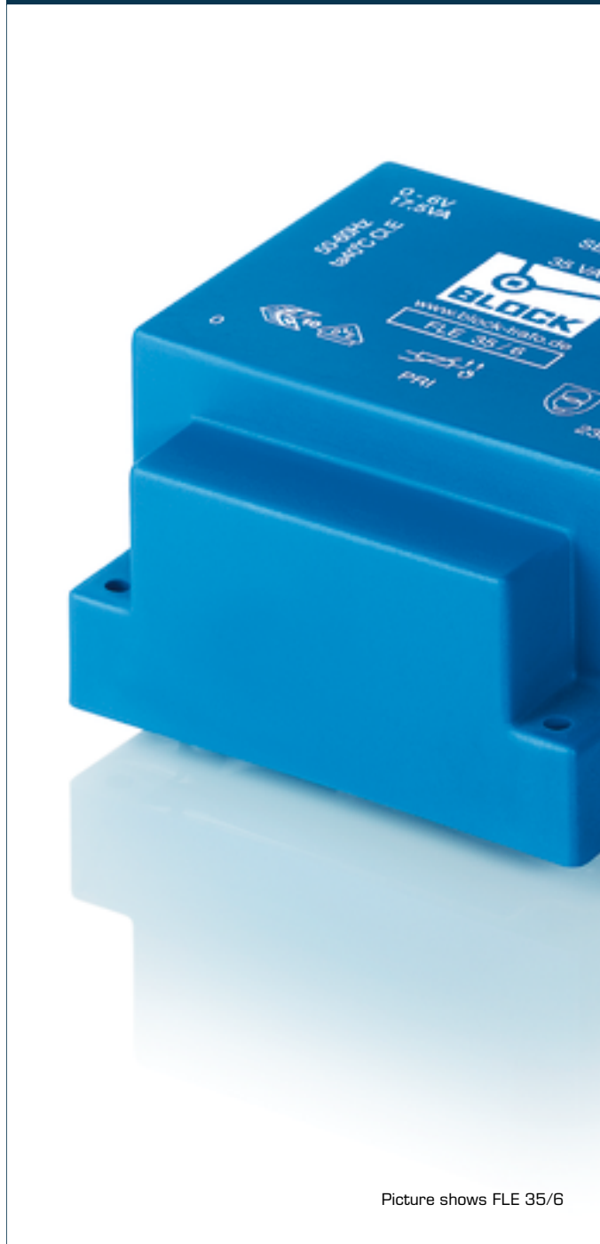
Picture shows FLE 35/6