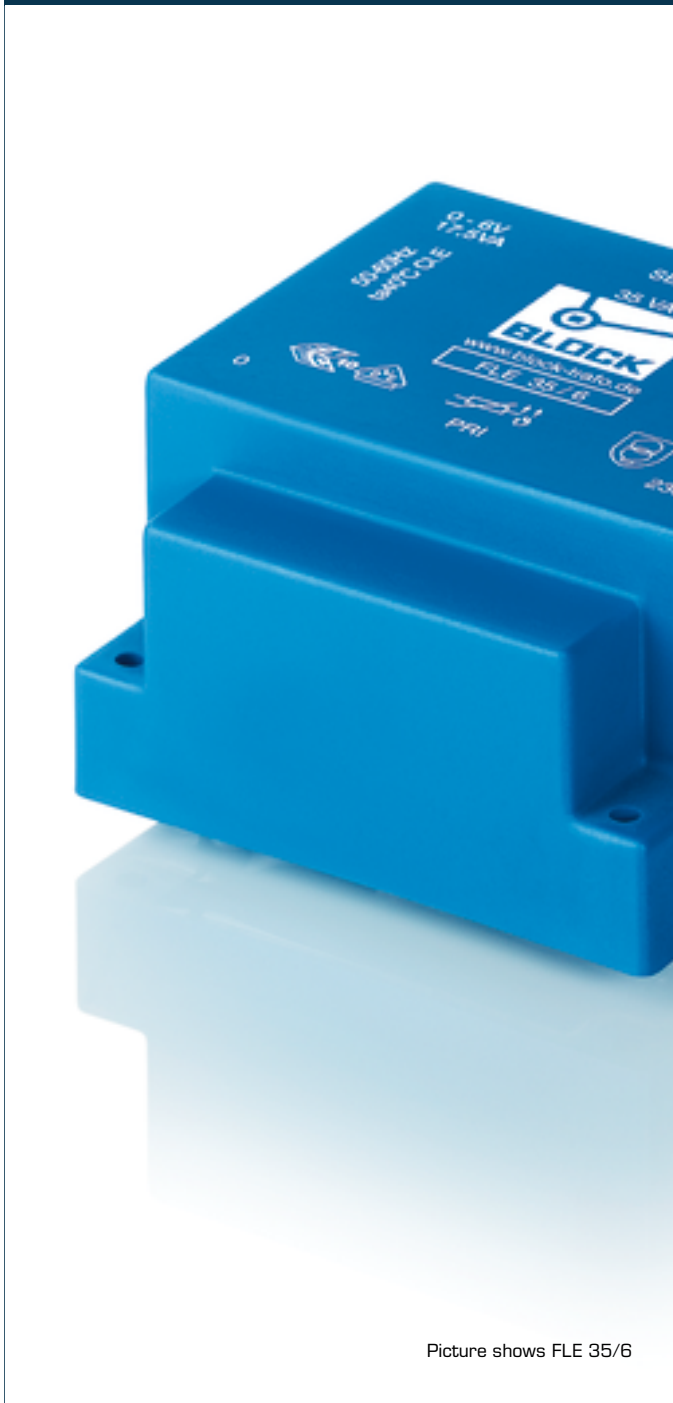
Picture shows FLE 35/6