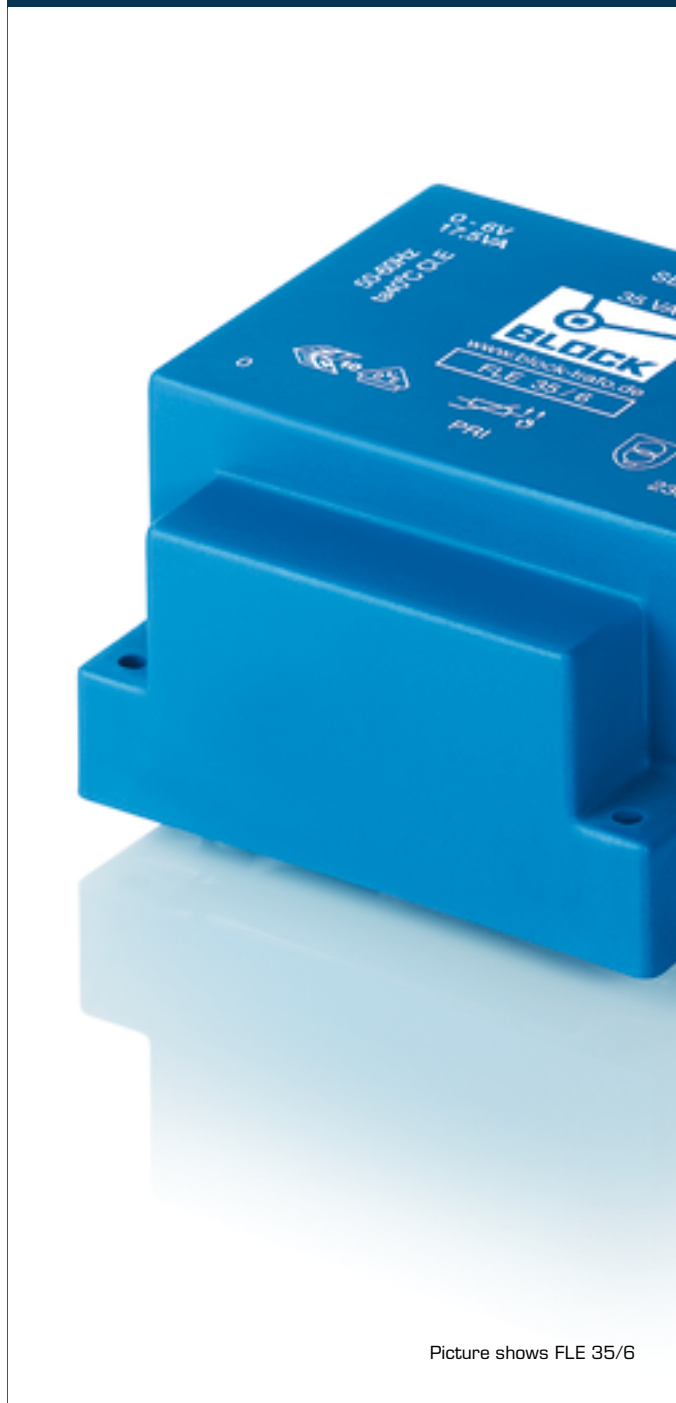
Picture shows FLE 35/6