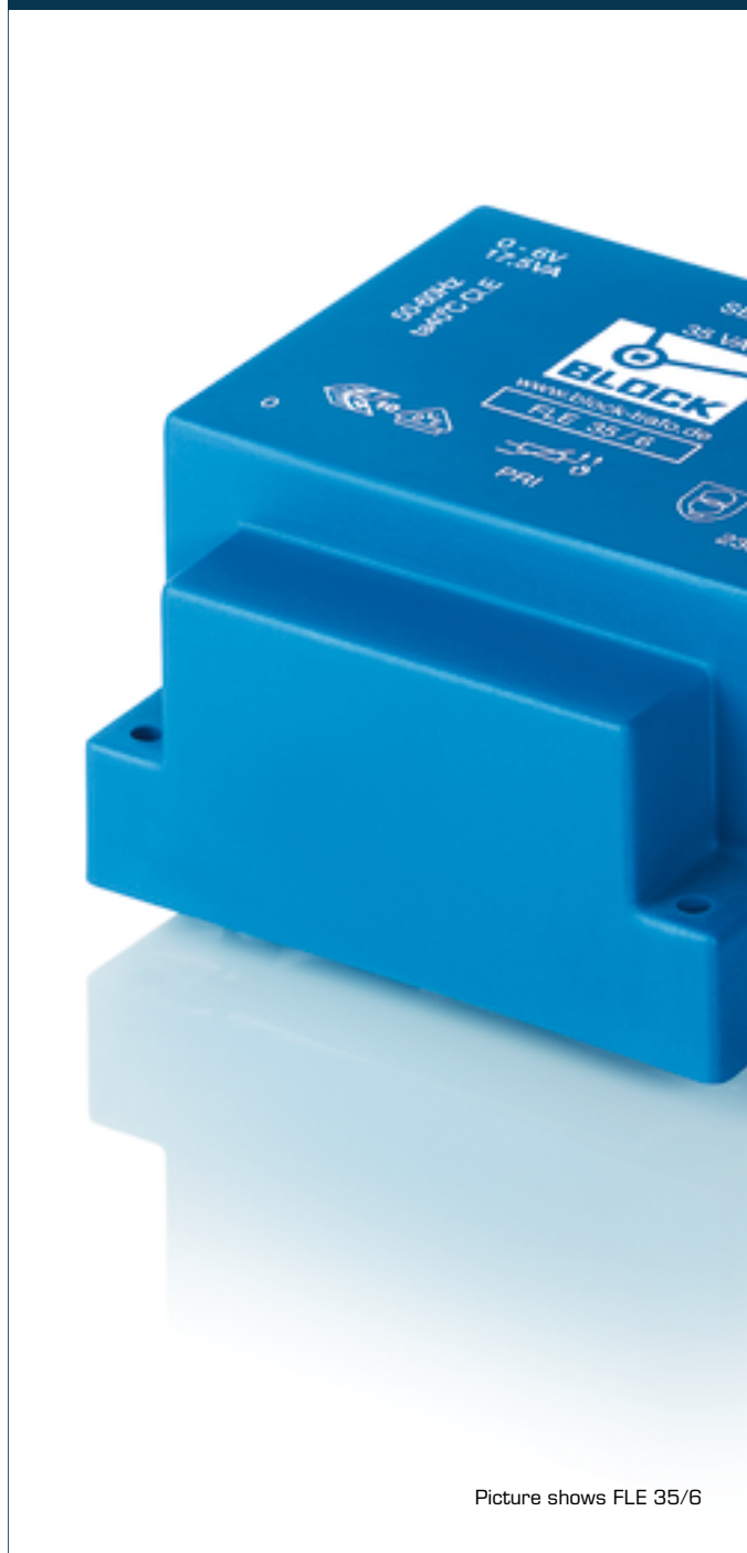
Picture shows FLE 35/6