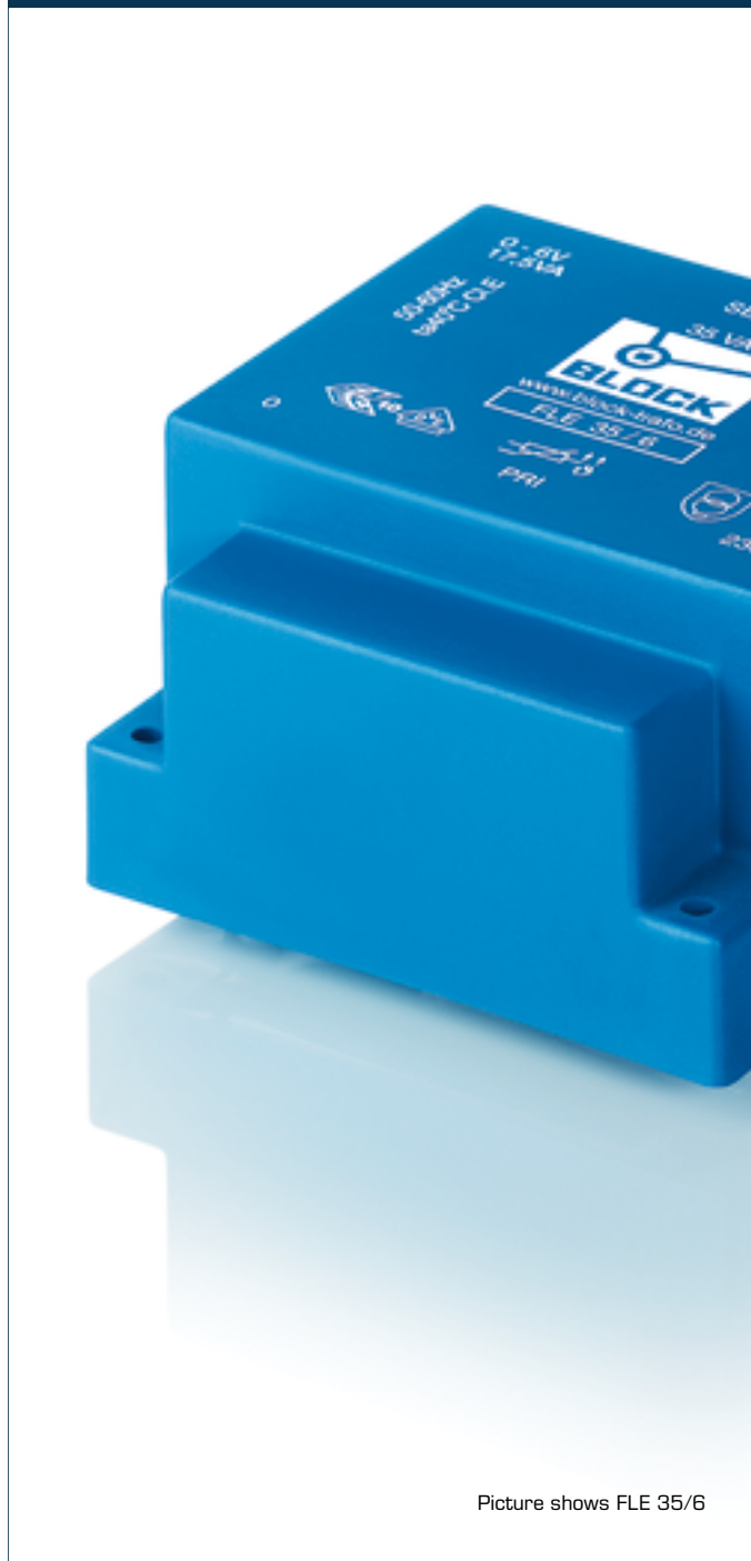
Picture shows FLE 35/6