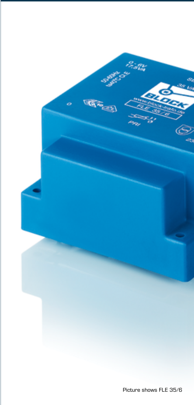
Picture shows FLE 35/6