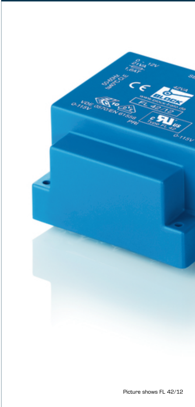
Picture shows FL 42/12