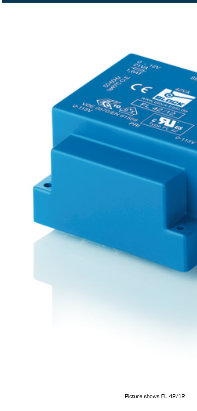
Picture shows FL 42/12