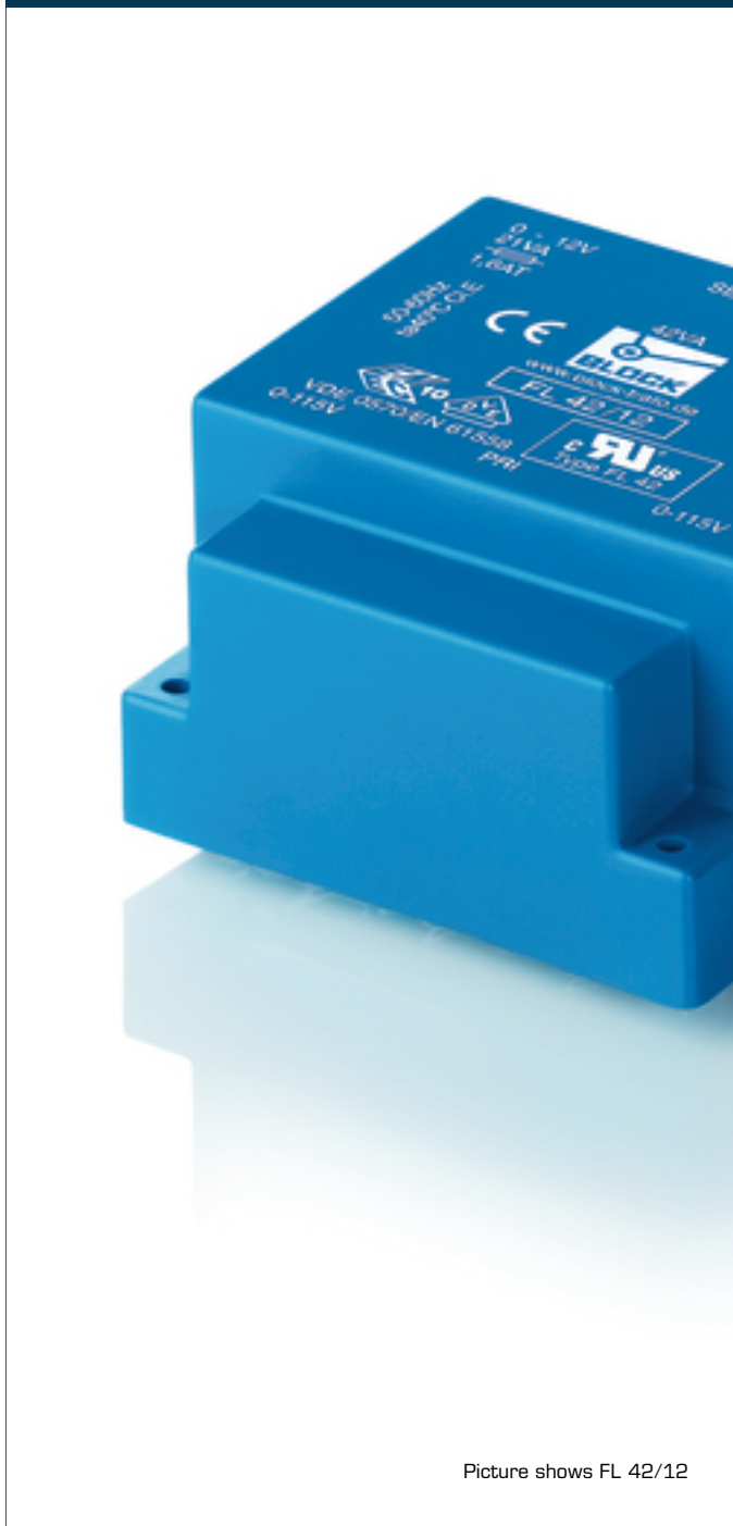
Picture shows FL 42/12