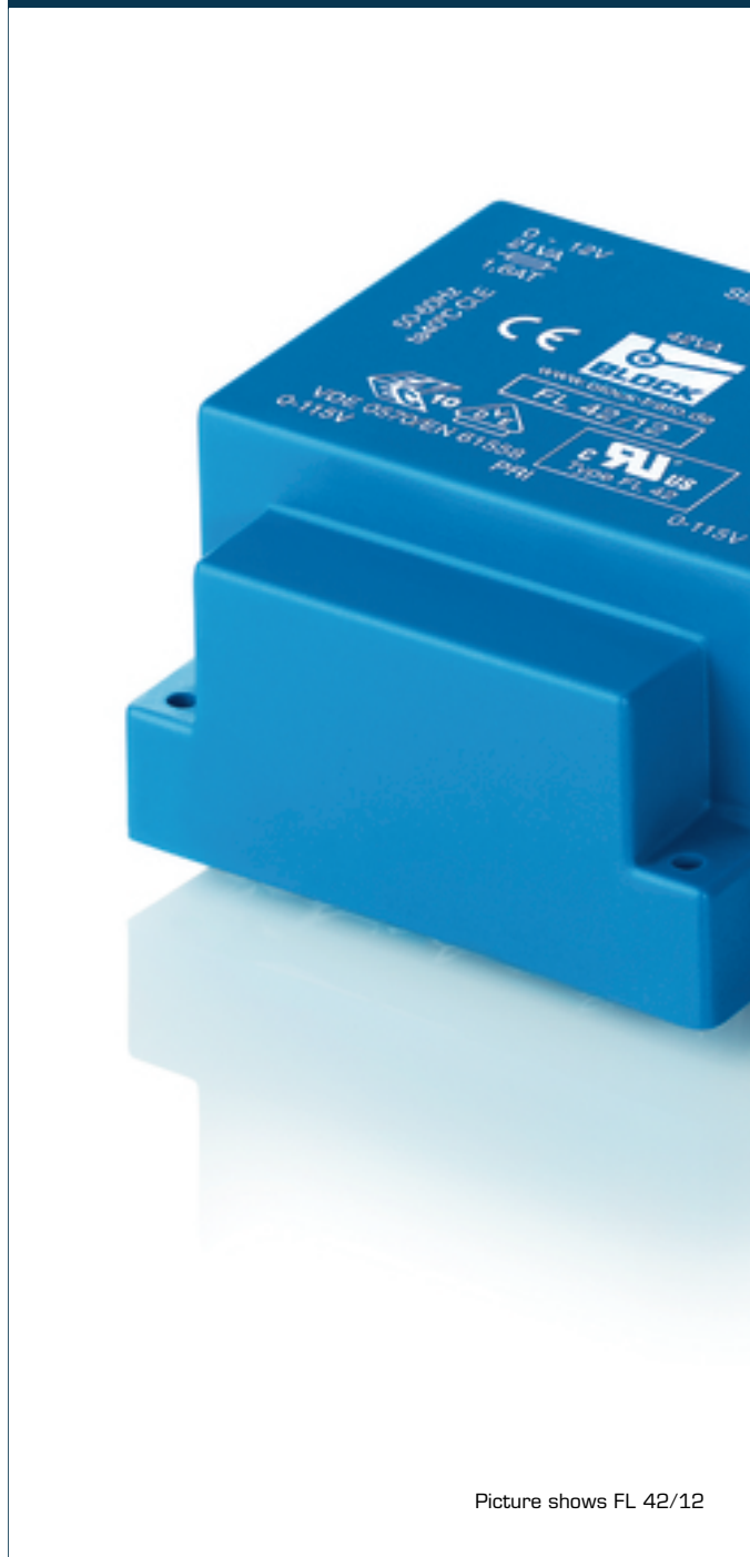
Picture shows FL 42/12