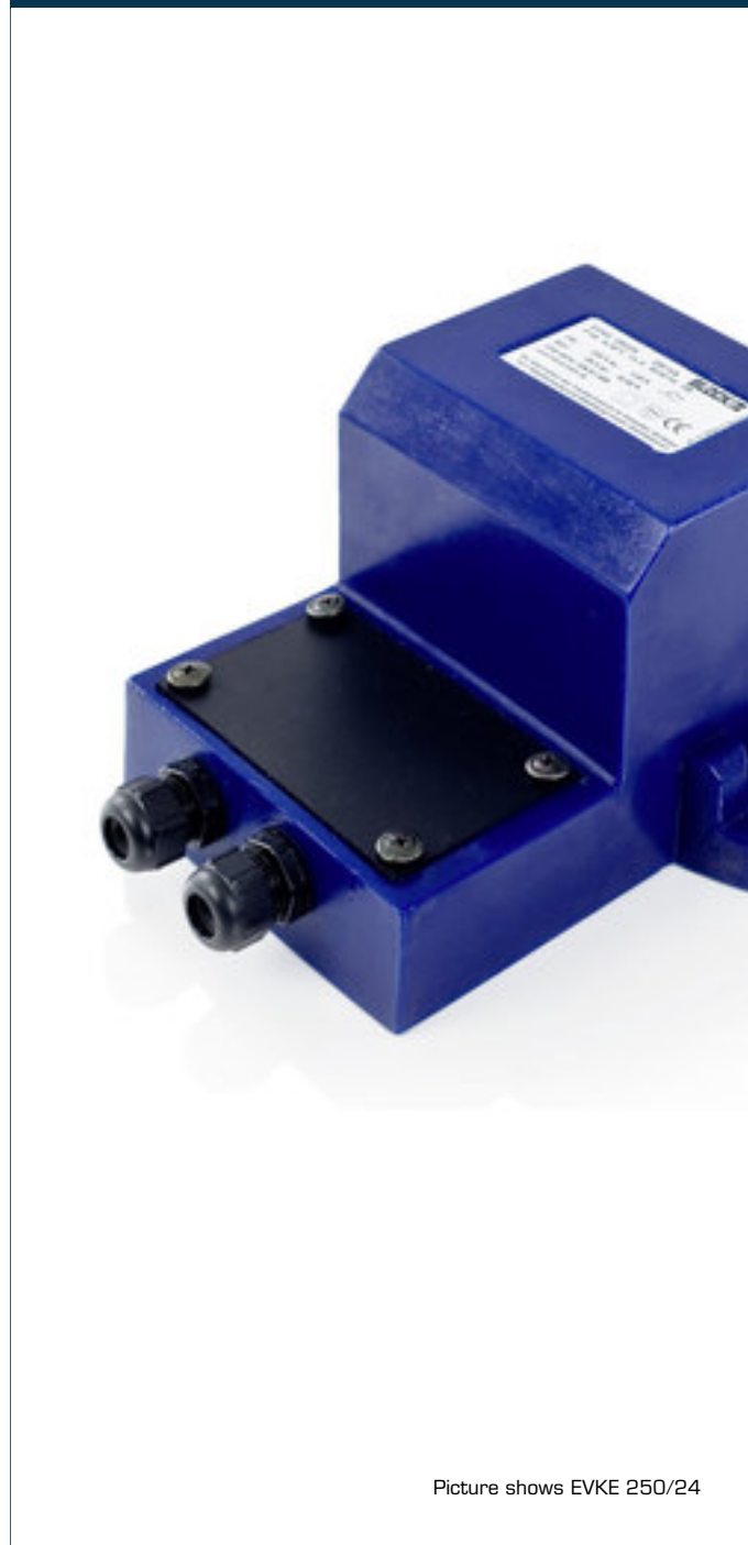
Picture shows EVKE 250/24