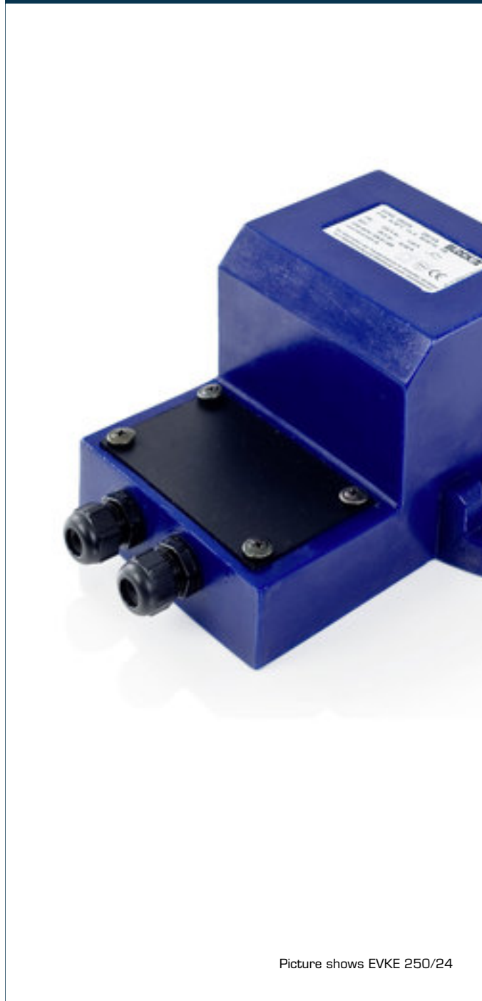
Picture shows EVKE 250/24