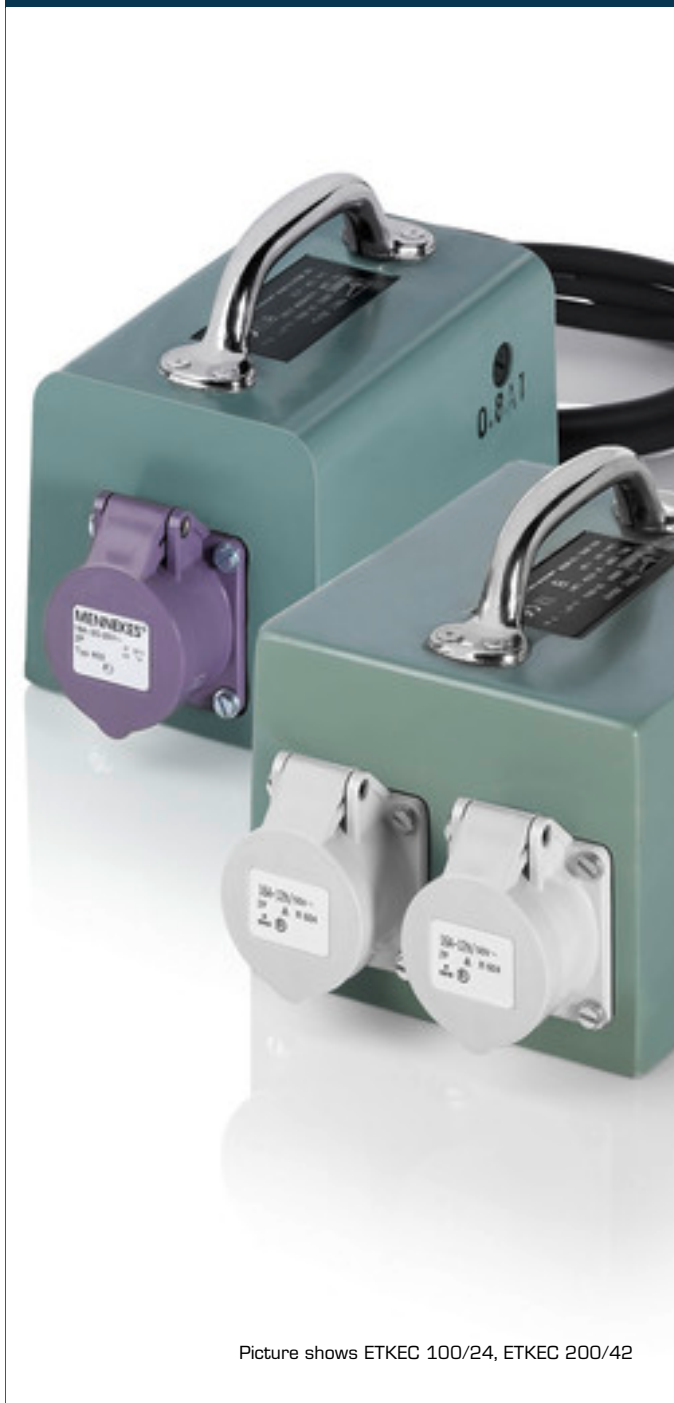
Picture shows ETKEC 100/24, ETKEC 200/42