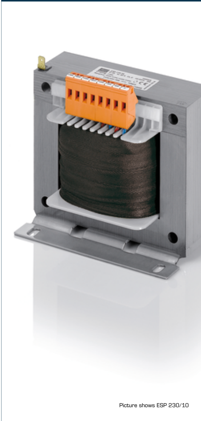
Picture shows ESP 230/10