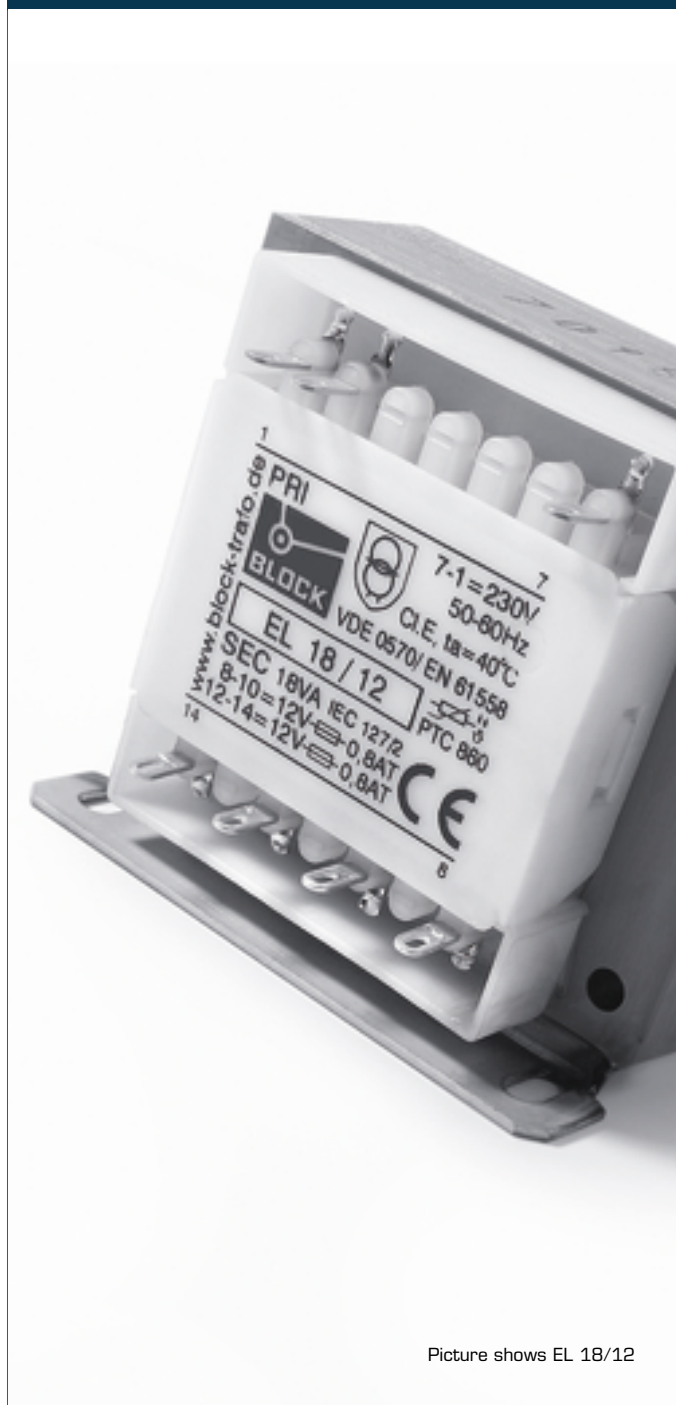
Picture shows EL 18/12