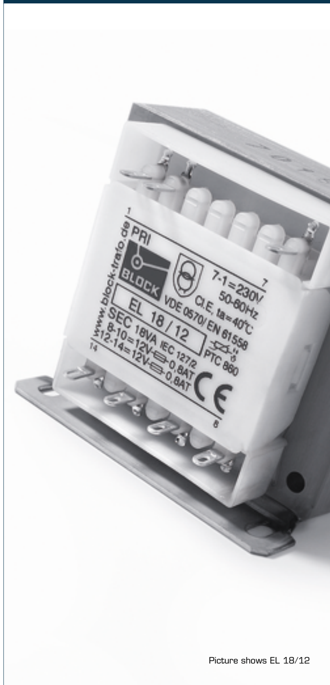
Picture shows EL 18/12