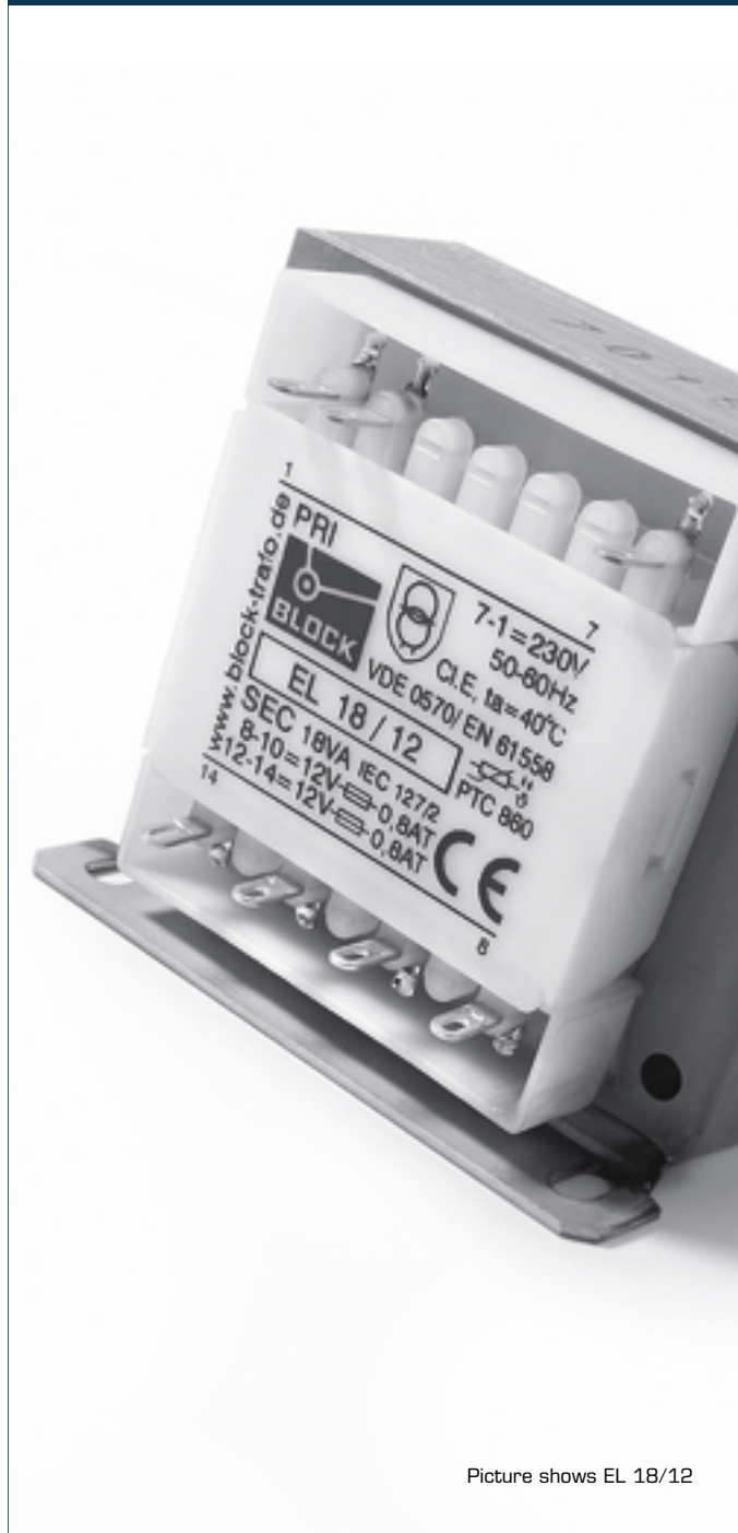
Picture shows EL 18/12