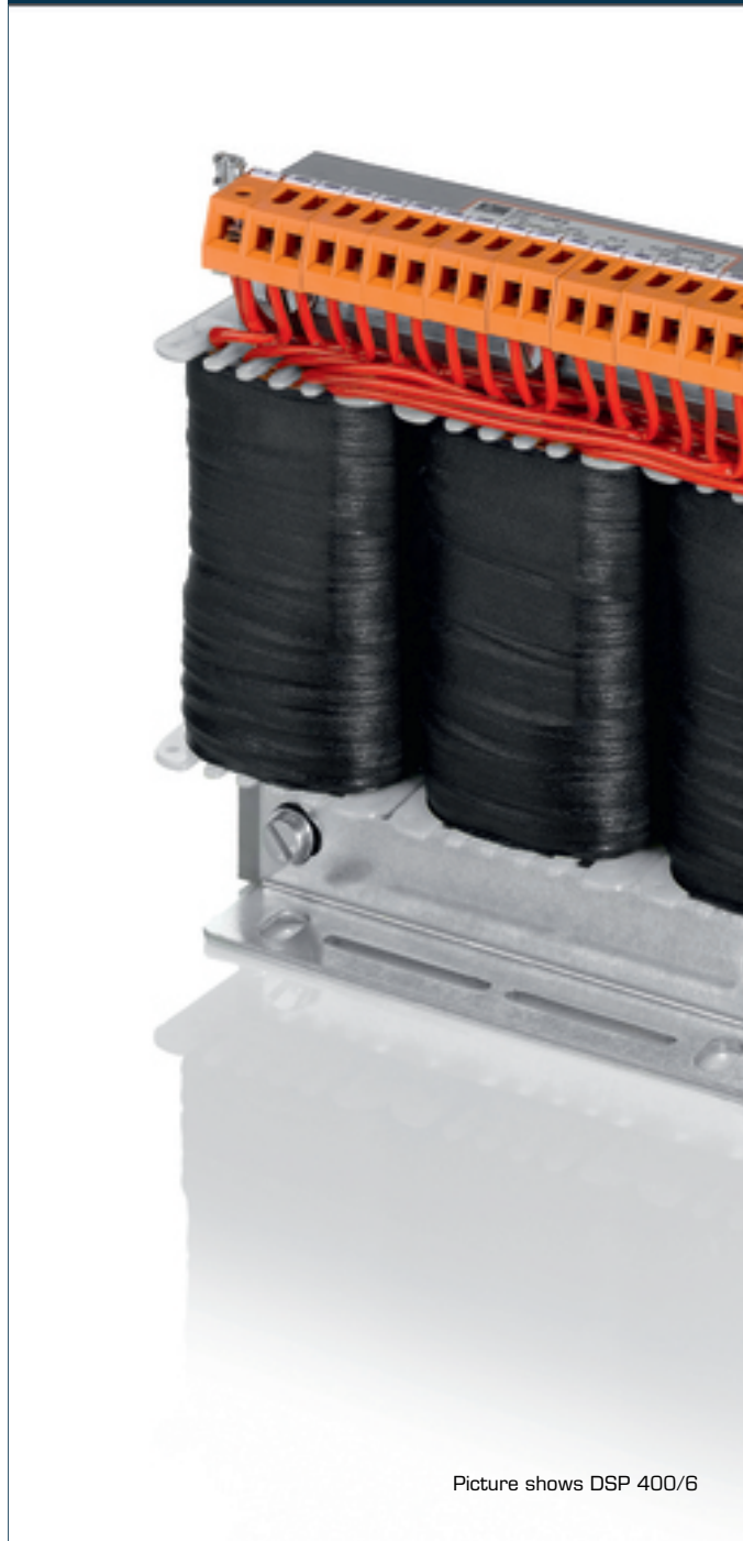
Picture shows DSP 400/6