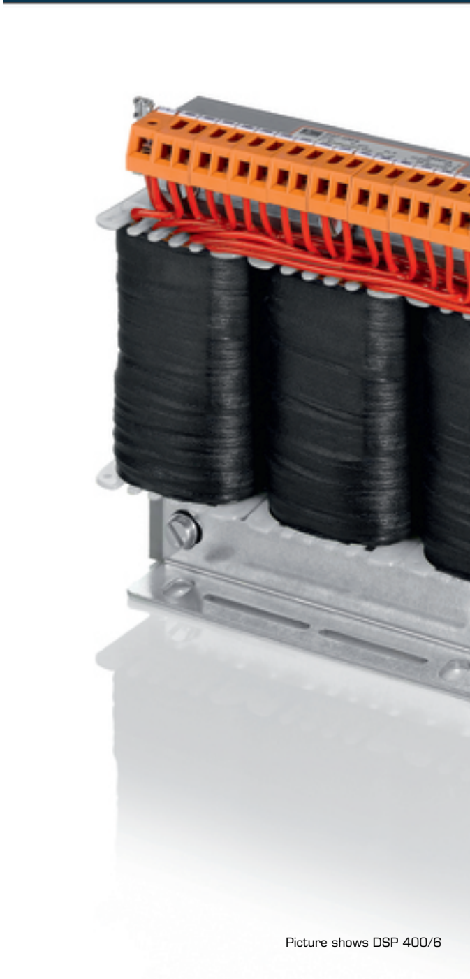
Picture shows DSP 400/6