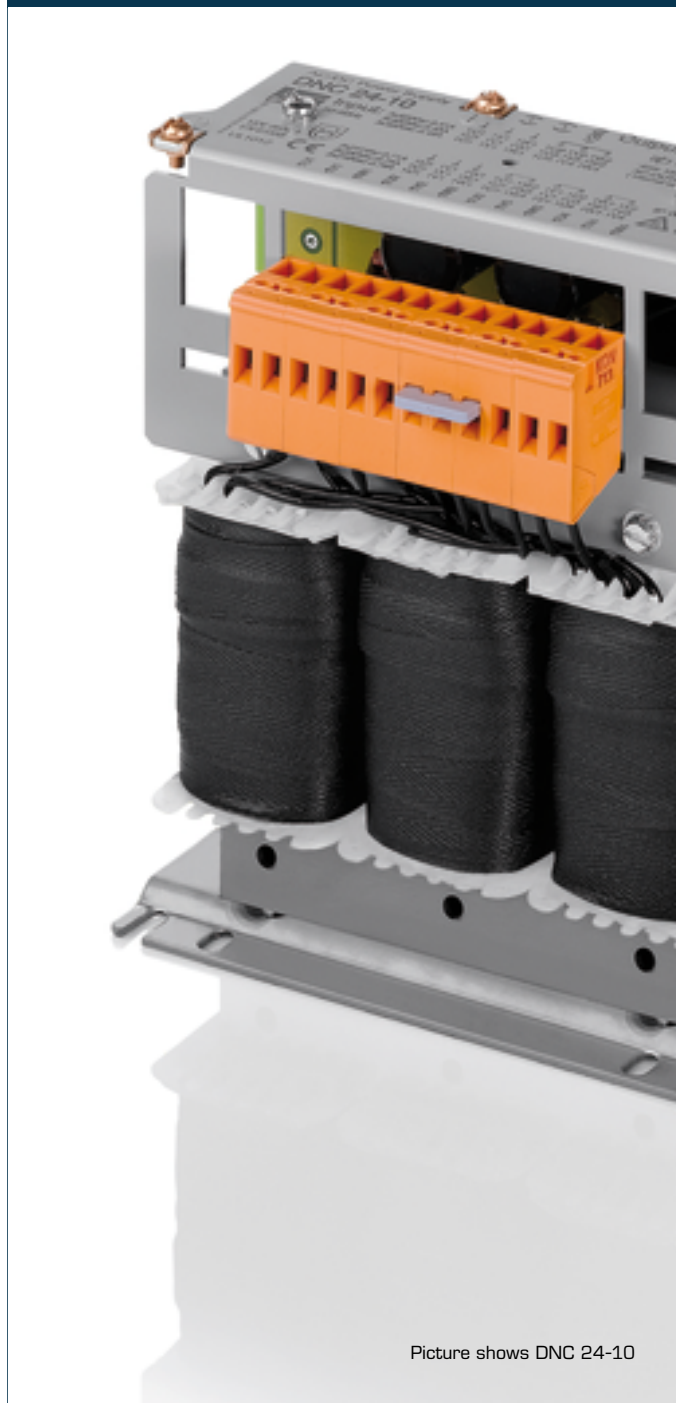
Picture shows DNC 24-10