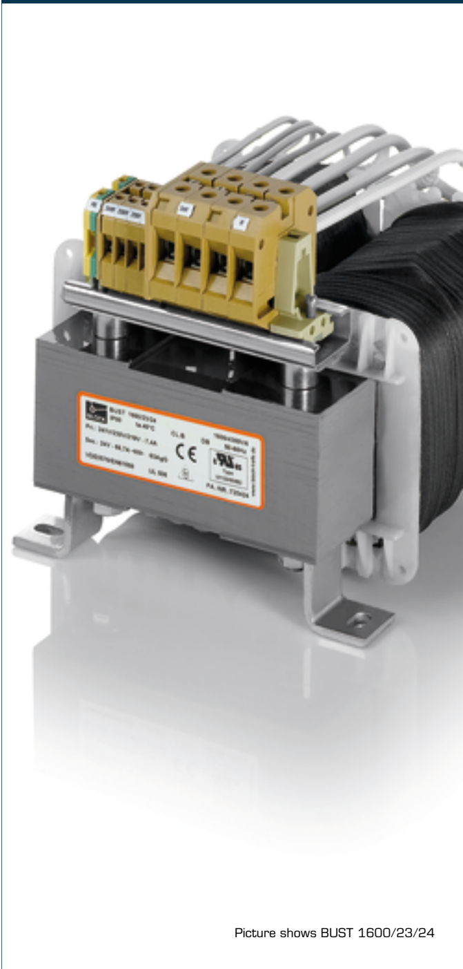
Picture shows BUST 1600/23/24