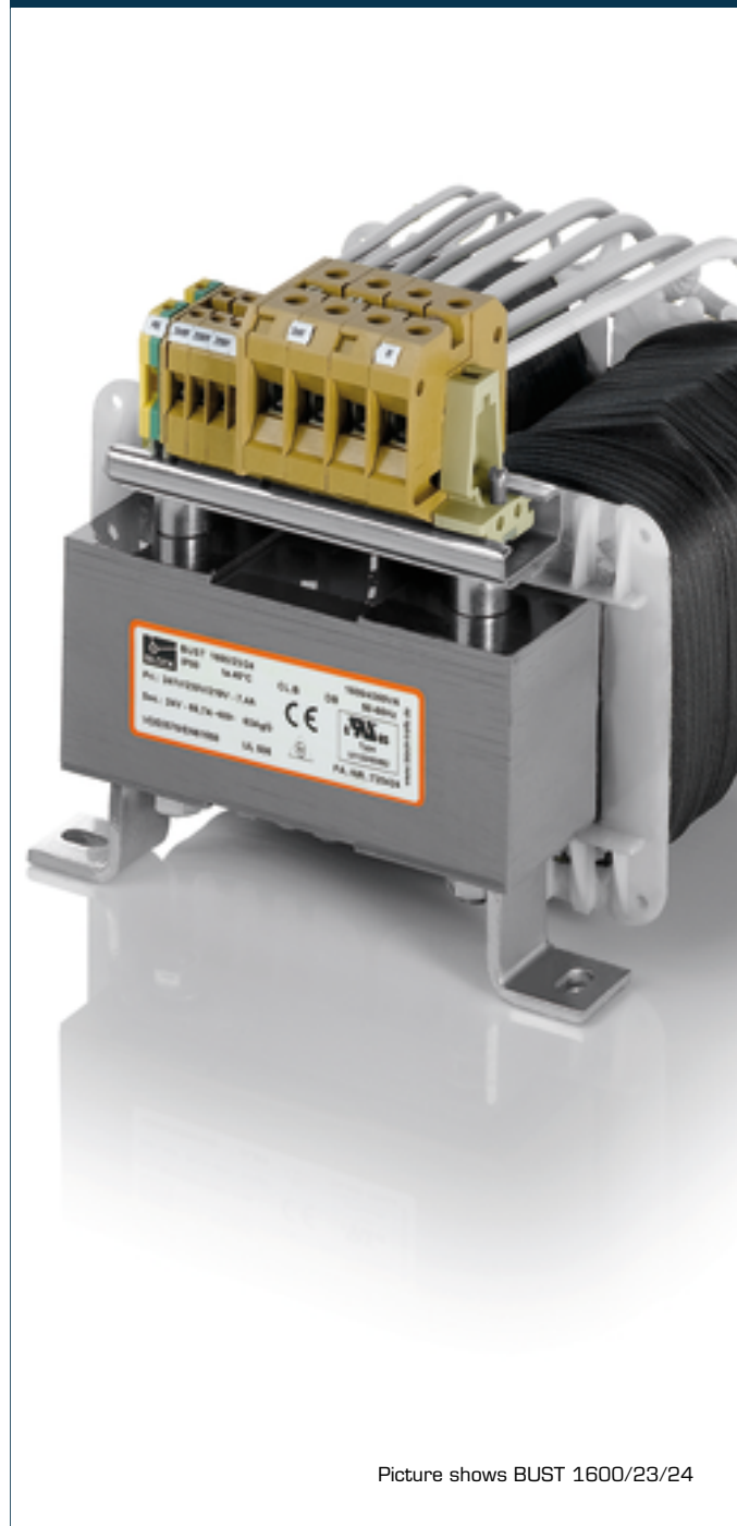
Picture shows BUST 1600/23/24