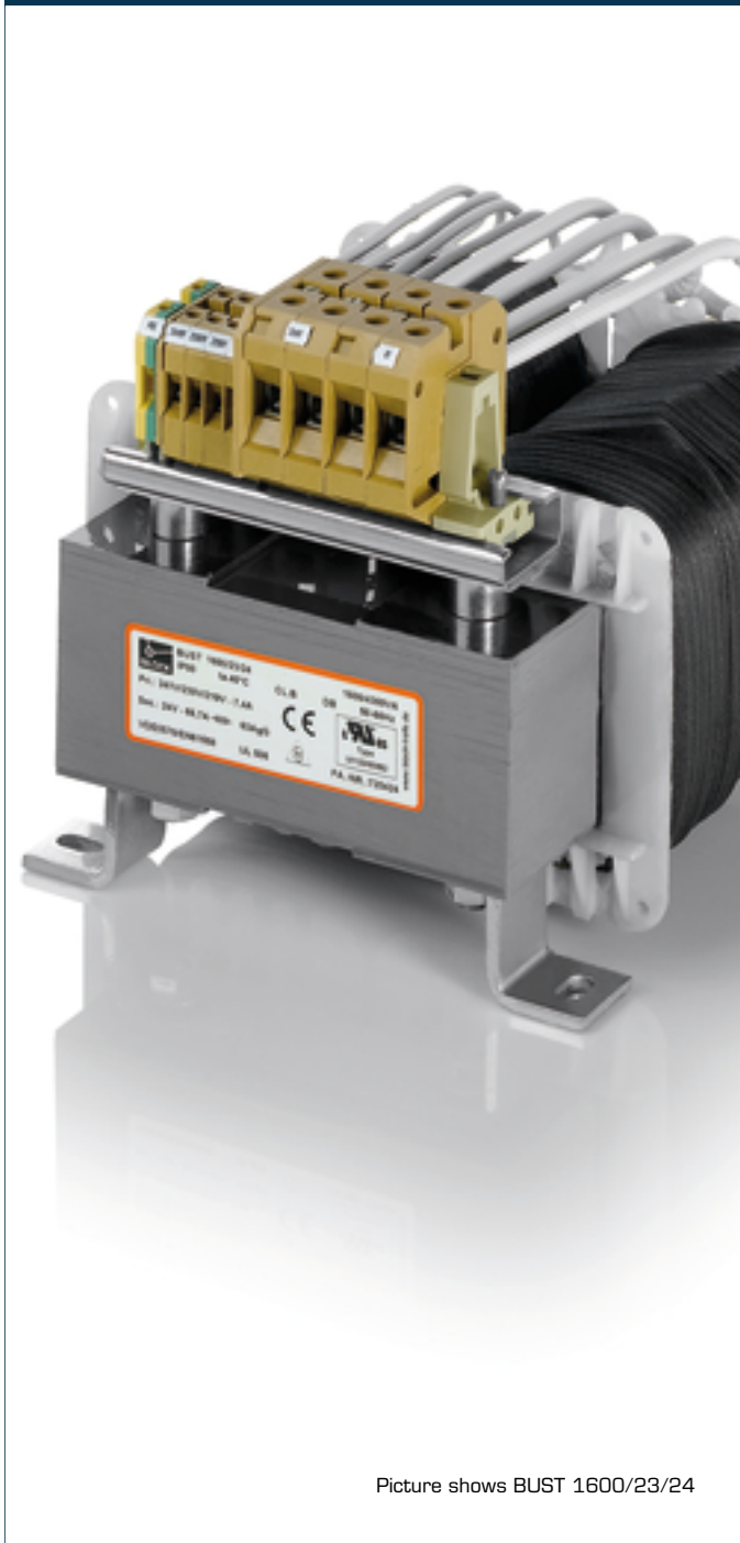
Picture shows BUST 1600/23/24