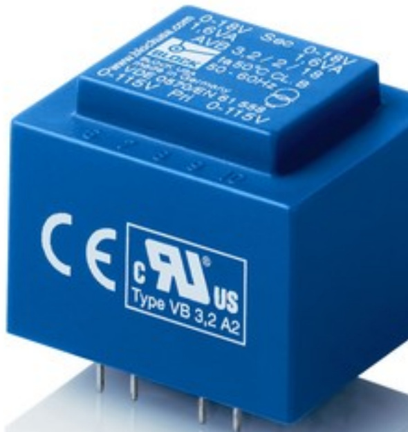
Picture shows AVB 3,2/2/18