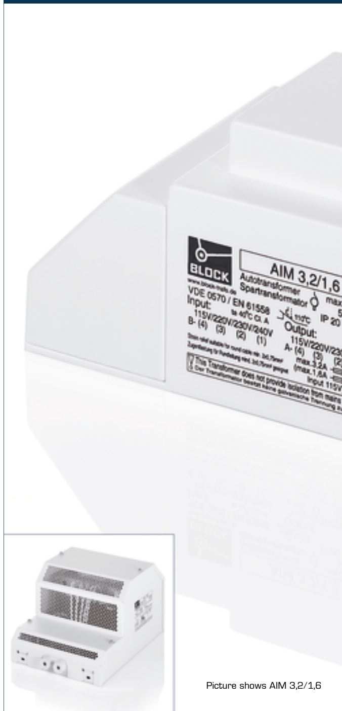
Picture shows AIM 3,2/1,6