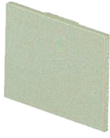
Insert label, I 0

Part no. 90SQ25 Catalog No. 038271 Alternate Catalog No. 90SQ25