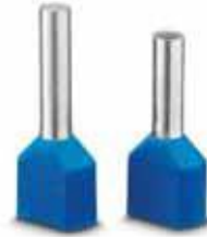
Conductor cross sections from 2 x 0.5 to 2 x 16 mm 2