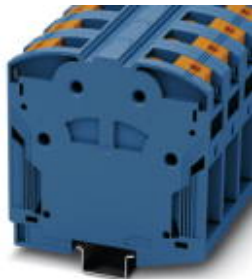
High-current terminal block, Connection method: Power-Turn connection, Number of positions: 1, Cross section: 50 mm 2 - 150 mm 2 , AWG: 1/0 - 300 kcmil, Width: 31 mm, Color: blue, Mounting type: NS 35/15

Please be informed that the data shown in this PDF Document is generated from our Online Catalog. Please find the complete data in the user's documentation. Our General Terms of Use for Downloads are valid ( http://phoenixcontact.com/download )