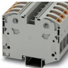
High-current terminal block, Connection method: Power-Turn connection, Cross section: 2.5 mm 2 - 35 mm 2 , AWG: 12 - 2, Width: 16 mm, Color: orange, Mounting type: NS 35/15

Please be informed that the data shown in this PDF Document is generated from our Online Catalog. Please find the complete data in the user's documentation. Our General Terms of Use for Downloads are valid ( http://phoenixcontact.com/download )