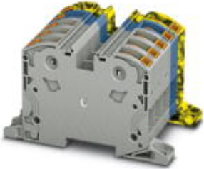
High-current terminal block, Connection method: Power-Turn connection, Cross section: 2.5 mm 2 - 35 mm 2 , AWG: 12 - 2, Width: 80 mm, Height: 68.3 mm, Color: gray/blue/black-yellow, Mounting type: NS 35/15

Please be informed that the data shown in this PDF Document is generated from our Online Catalog. Please find the complete data in the user's documentation. Our General Terms of Use for Downloads are valid ( http://phoenixcontact.com/download )