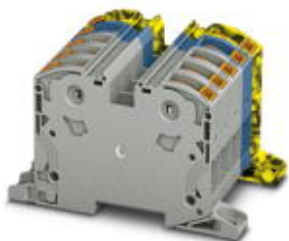
High-current terminal block, Connection method: Power-Turn connection, Cross section: 2.5 mm 2 - 35 mm 2 , AWG: 12 - 2, Width: 64 mm, Height: 68.3 mm, Color: gray/blue, Mounting type: NS 35/15

Please be informed that the data shown in this PDF Document is generated from our Online Catalog. Please find the complete data in the user's documentation. Our General Terms of Use for Downloads are valid ( http://phoenixcontact.com/download )