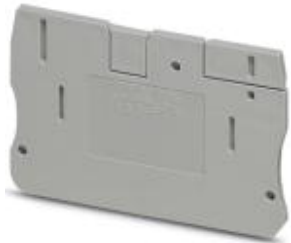
End cover, Length: 57.7 mm, Width: 2.2 mm, Height: 42 mm, Color: gray

Please be informed that the data shown in this PDF Document is generated from our Online Catalog. Please find the complete data in the user's documentation. Our General Terms of Use for Downloads are valid ( http://phoenixcontact.com/download )