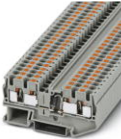
Component terminal block, with integrated diode, Connection method: Push-in connection, Cross section: 0.2 mm 2 - 6 mm 2 , AWG: 24 - 10, Width: 6.2 mm, Color: gray, Mounting type: NS 35/7,5, NS 35/15

Please be informed that the data shown in this PDF Document is generated from our Online Catalog. Please find the complete data in the user's documentation. Our General Terms of Use for Downloads are valid ( http://phoenixcontact.com/download )