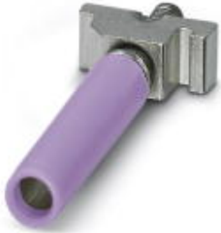
Female test connector, With slide, Color: violet

Please be informed that the data shown in this PDF Document is generated from our Online Catalog. Please find the complete data in the user's documentation. Our General Terms of Use for Downloads are valid ( http://phoenixcontact.com/download )