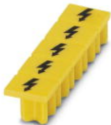
Warning cover, 5-pos., for terminal width: 5.2 mm

Please be informed that the data shown in this PDF Document is generated from our Online Catalog. Please find the complete data in the user's documentation. Our General Terms of Use for Downloads are valid ( http://phoenixcontact.com/download )