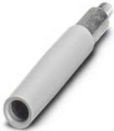
Female test connector, Color: transparent

Please be informed that the data shown in this PDF Document is generated from our Online Catalog. Please find the complete data in the user's documentation. Our General Terms of Use for Downloads are valid ( http://phoenixcontact.com/download )