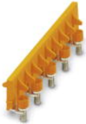
Switching jumper, Number of positions: 10, Color: orange

Please be informed that the data shown in this PDF Document is generated from our Online Catalog. Please find the complete data in the user's documentation. Our General Terms of Use for Downloads are valid ( http://phoenixcontact.com/download )