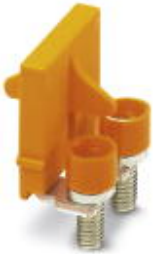
Switching jumper, Width: 15.3 mm, Number of positions: 2, Color: orange

Please be informed that the data shown in this PDF Document is generated from our Online Catalog. Please find the complete data in the user's documentation. Our General Terms of Use for Downloads are valid ( http://phoenixcontact.com/download )