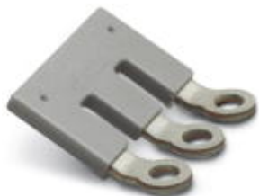
Insertion bridge, Number of positions: 3, Color: gray

Please be informed that the data shown in this PDF Document is generated from our Online Catalog. Please find the complete data in the user's documentation. Our General Terms of Use for Downloads are valid ( http://phoenixcontact.com/download )