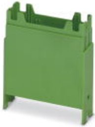
Intermediate element, to enlarge the assembly space

Please be informed that the data shown in this PDF Document is generated from our Online Catalog. Please find the complete data in the user's documentation. Our General Terms of Use for Downloads are valid ( http://phoenixcontact.com/download )