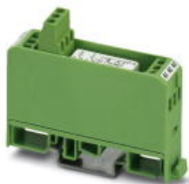
Relay module, with soldered-in miniature switching relay, contact (AgNi+Au): Small to large loads, 2 PDT, 24 V AC/DC input voltage

Please be informed that the data shown in this PDF Document is generated from our Online Catalog. Please find the complete data in the user's documentation. Our General Terms of Use for Downloads are valid ( http://phoenixcontact.com/download )