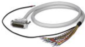
The figure shows the 25-pos. version

Shielded cable with a 9-pos. D-SUB pin strip and one open end. The individual wires are labeled 1 to 9 and fitted with ferrules. The braided shield is routed to a separate cable end. Cable length: 3 m.